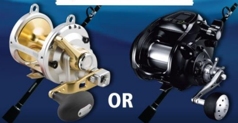
TALICA 50 w STATUS BLUEWATER GAME BENT BUTT (WORTH $1700)