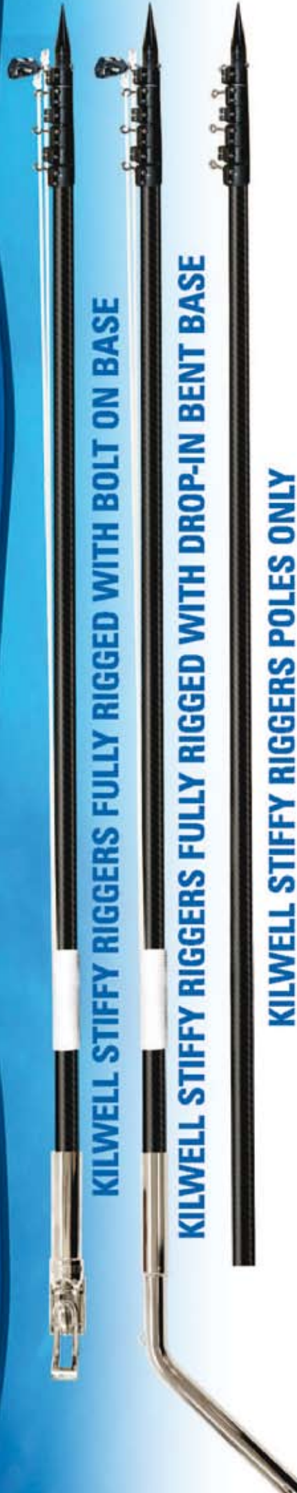
KILWELL STIFFY RIGGERS FULLY RIGGED WITH BOLT ON BASE